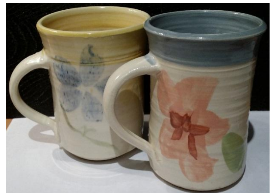
Tapestry pattern -earthenware