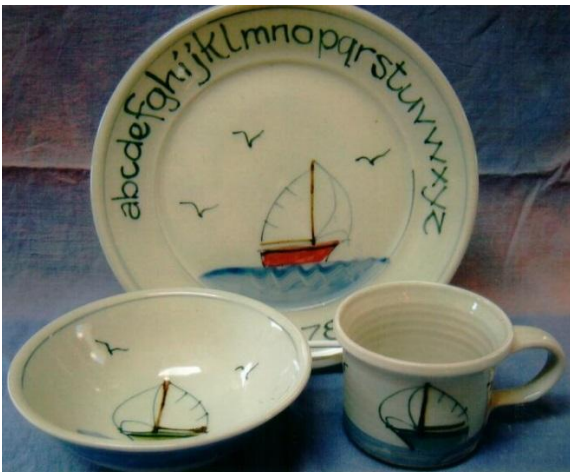
Kid Set (also came in trains, dinosaurs, and teddy bears)