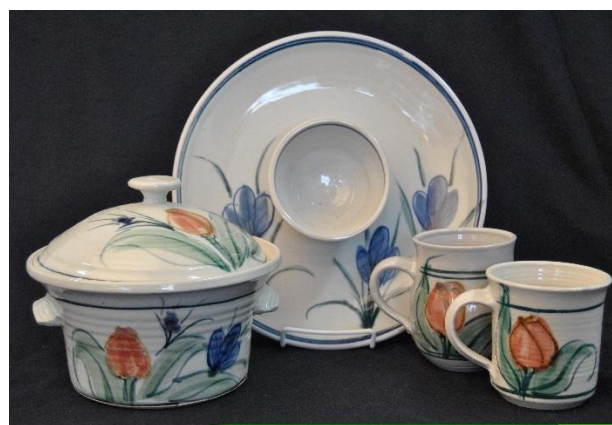
Bouquet, Crocus, Tulip